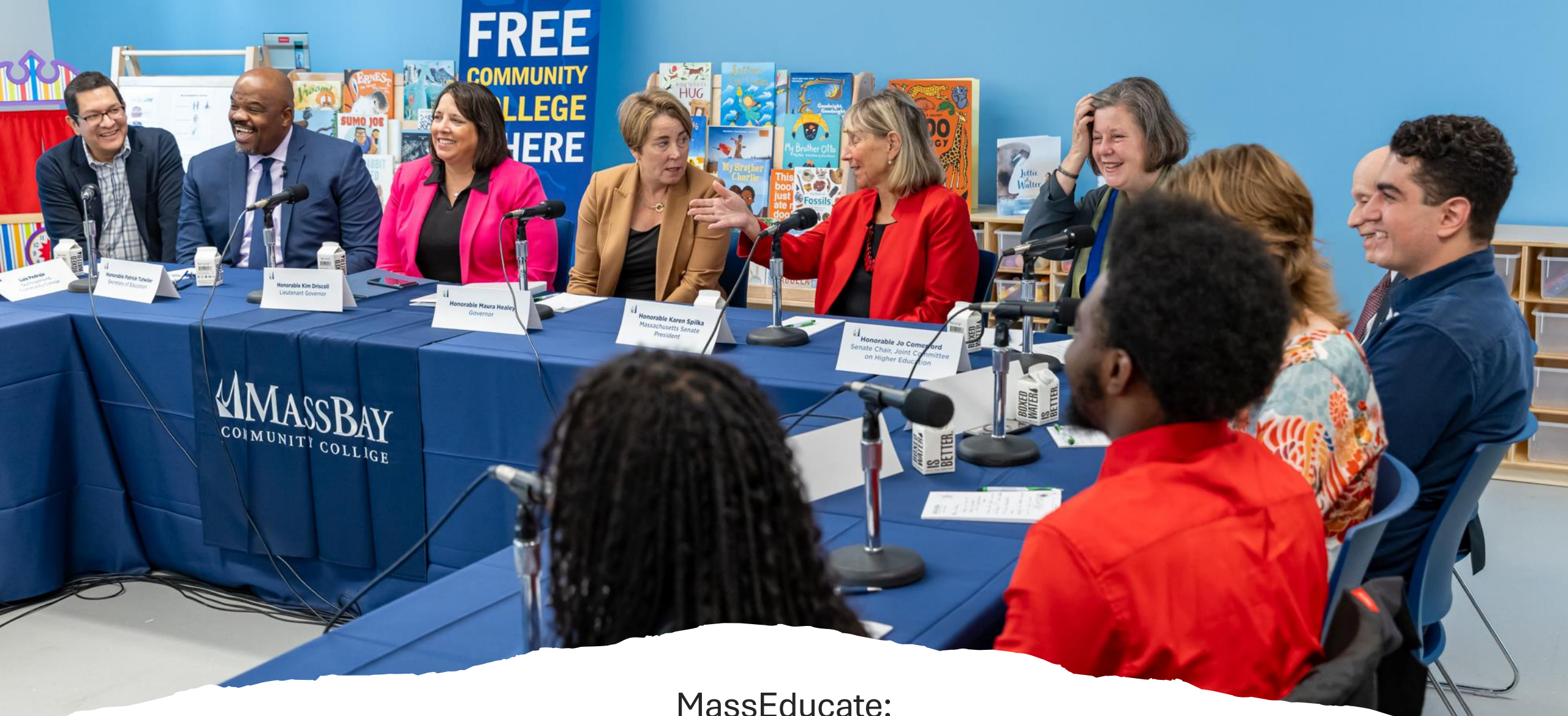
MassEducate: Free Community College for Students of All Ages